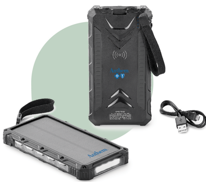
SUPER OFF-ROAD SOLAR WIRELESS POWER BANK T1037