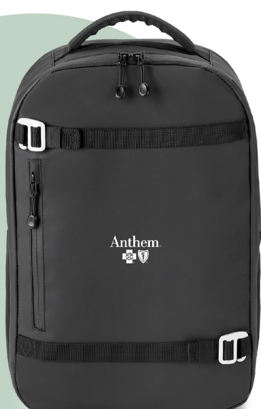
CALL OF THE WILD OVERNIGHTER BACKPACK BG117