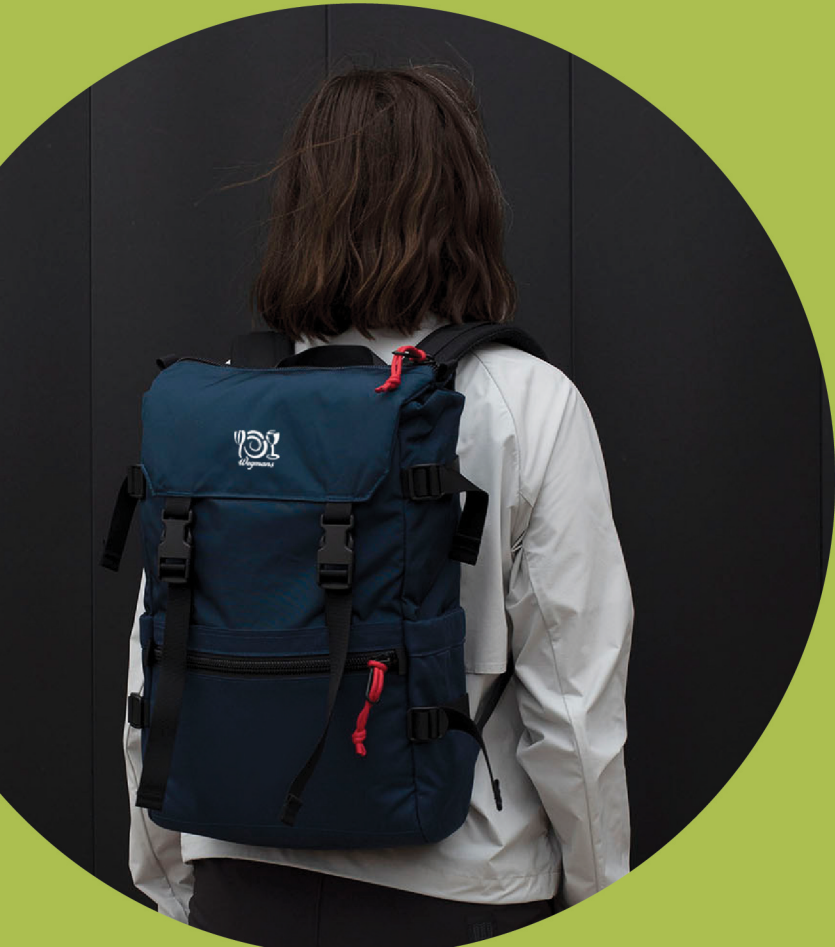
ROVER PACK BG120