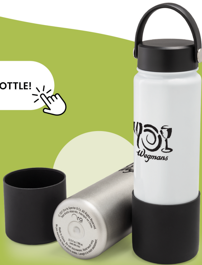
THE BOOT DW313