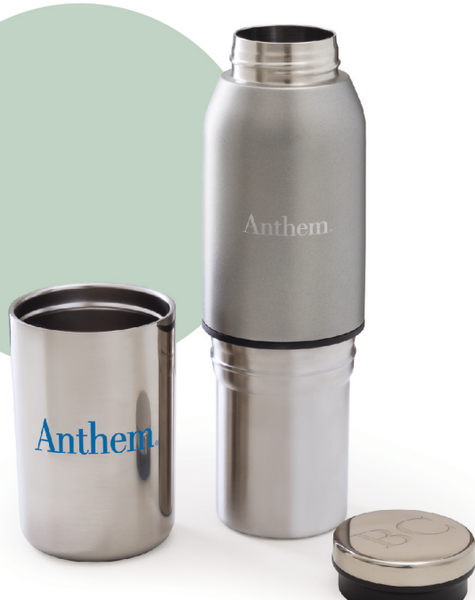
SWITCH-HITTER 2-IN-1 DW316