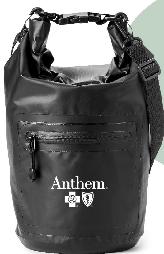
CALL OF THE WILD WATER RESISTANT 5L DRYBAG BG701